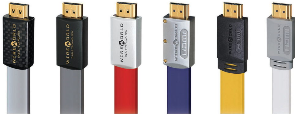
Platinum Starlight® 7 PSH

The Ultraviolet 7, Chroma 7 and Island 7 cables utilize Wireworld's exclusive 16-conductor Symmetricon® design to provide faster transmission speed than conventional HDMI cable designs, in addition to Composilex 2 insulation, resulting in industry leading performance and value. Transmission speed is a dominant factor in HDMI cable performance and faster cables produce distinctly cleaner sound and sharper images. Even the longest lengths