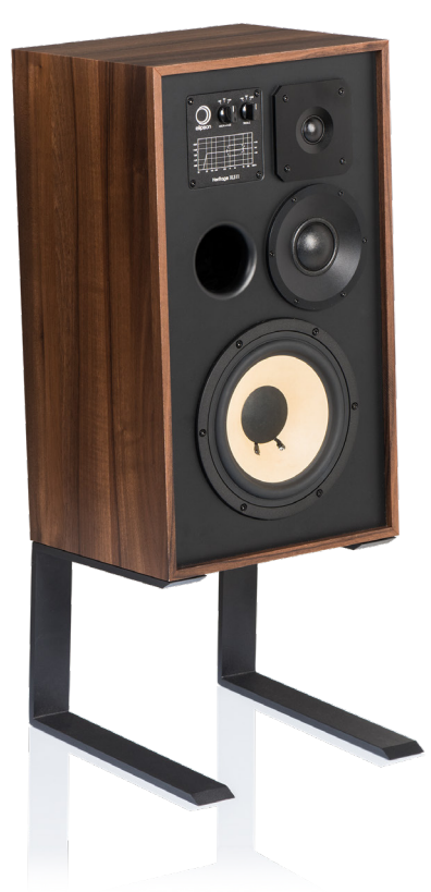
*Stands in option